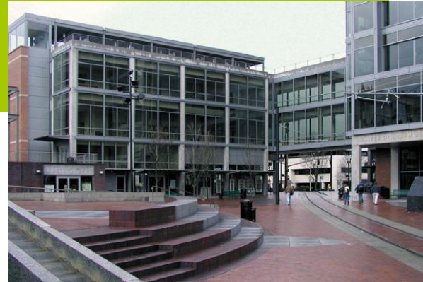
Hatfield School of Government, Portland State University