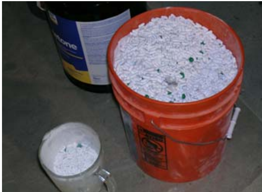
Figure 4. Five-Gallon Bucket of Pseudoephedrine Seized in 2008

Note: This waste was left alongside the road in a commercial orchard in Merced County in 2008. Among the waste were approximately 10,000 empty pseudoephedrine blister packs.