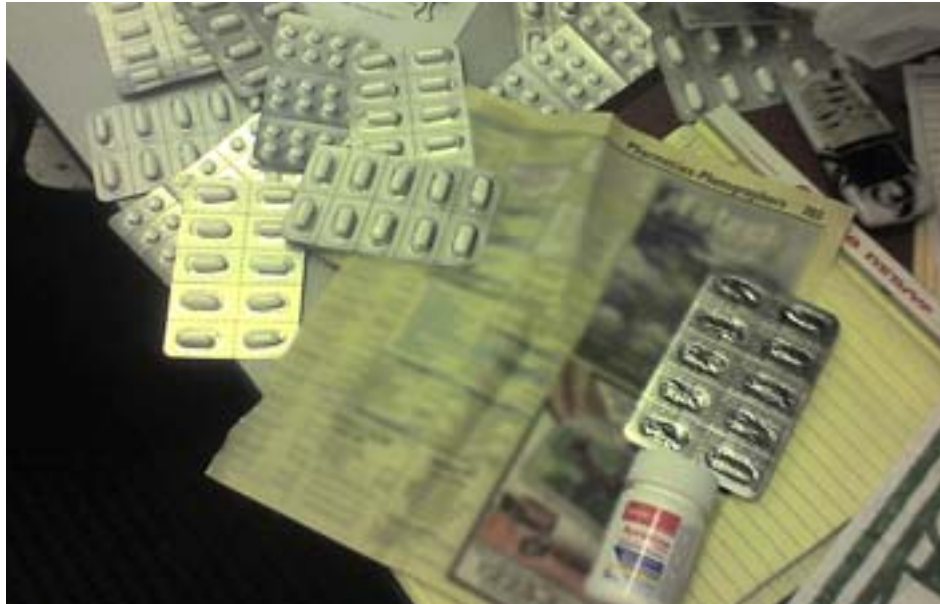
Figure 1. Smurfing Evidence Seized From a Vehicle in 2007