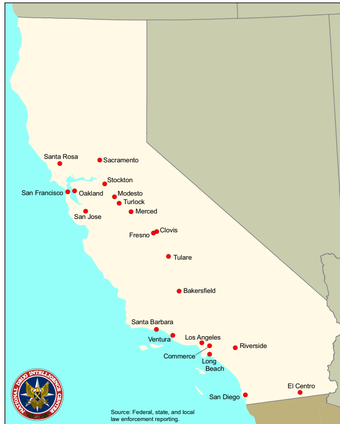
Figure 2. California Cities Where Law Enforcement Officials Reported an Increase in Pseudoephedrine Smurfing in 2008 and 2009